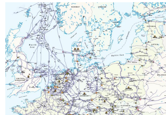
GIE/ENTSOG – Existing NG